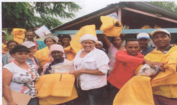
Pre-positioned CWS Blankets were also distributed in San Juan de la Maguana, Dominican Republic, following Hurricane Sandy.

CWS Disaster Response Specialists continue working with state, regional and local organizations, the Federal Emergency Management Agency, our member denominations and other agencies to determine where further assistance is needed.