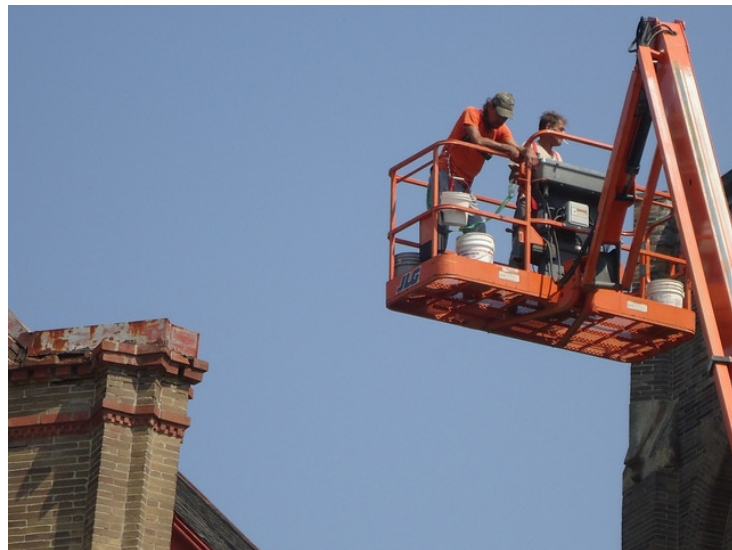
Too high for me!!!