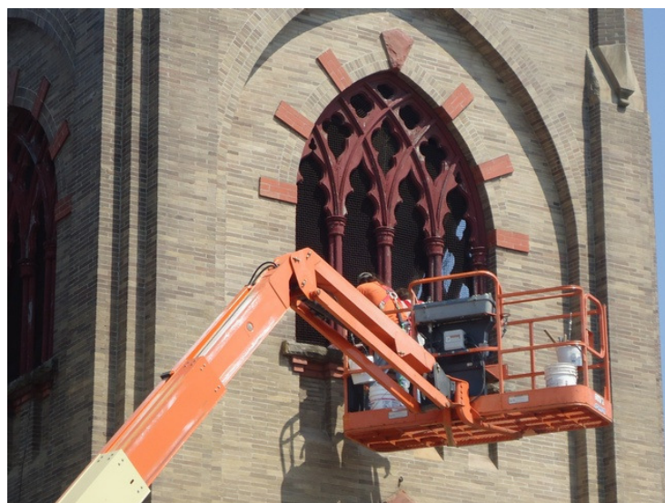
Inspecting the tracery.