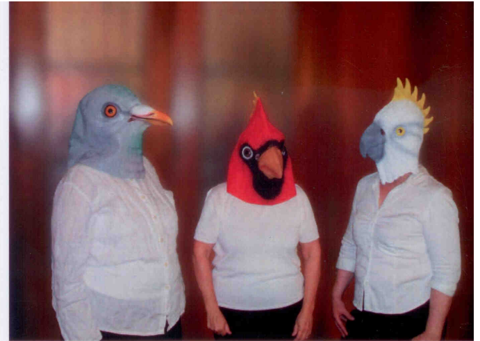
Nightingale, Firebird and the Hoopoe Present the thoughts of Fatima, Salman and Muhammad